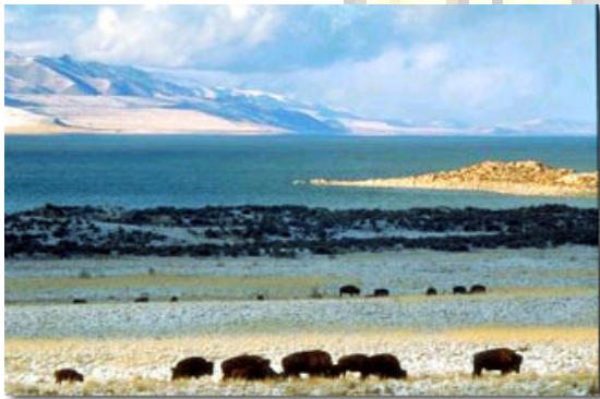
Bison on Antelope Island, in the Great Salt Lake

Antelope Island, the largest island in the Great Salt Lake, is accessed via a 7.2-mile causeway. Its 28,022 acres are home to a unique variety of wildlife. Also featured are 25 miles of backcountry trails for hiking, mountain biking, and horseback riding, a visitor center that's open year-round, and tours of the Fielding Garr Historic Ranch House. Facilities include RV and primitive camping, a beach picnic area, and marina.